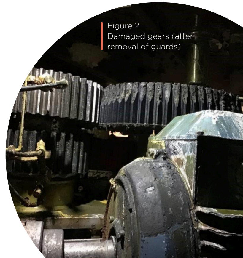
Figure 2 Damaged gears (after removal of guards)